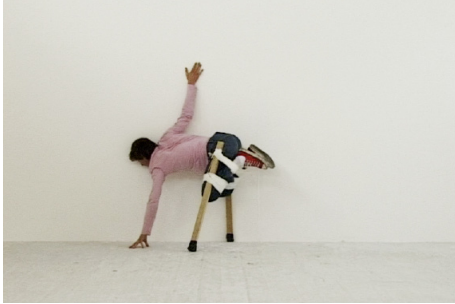
EXTENSIONS EX1 LOOP 5:03 MIN VARIOUS DIMENSIONS FOR PRESENTATION