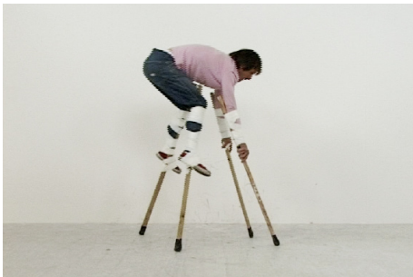
EXTENSIONS EX3 LOOP 3:50 MIN VARIOUS DIMENSIONS FOR PRESENTATION