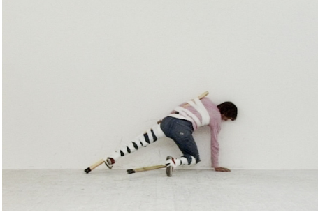
EXTENSIONS EX6 LOOP 4:23 MIN VARIOUS DIMENSIONS FOR PRESENTATION