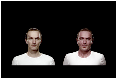
PRESSURE 2X (COMPILATION) LOOP 2:22 MIN VARIOUS DIMENSIONS FOR PRESENTATION