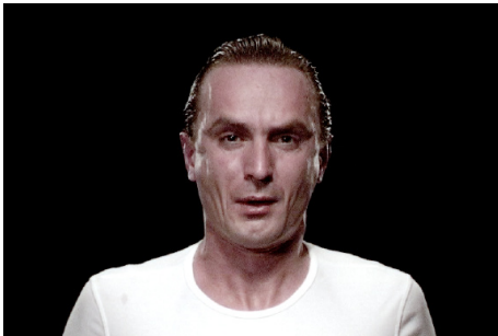
PRESSURE DOWN LOOP 6:34 MIN VARIOUS DIMENSIONS FOR PRESENTATION