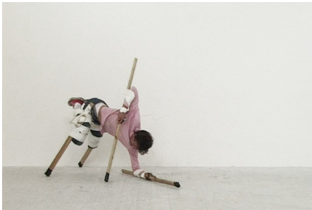
EXTENSIONS EX2 LOOP 3:21 MIN VARIOUS DIMENSIONS FOR PRESENTATION