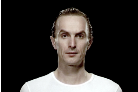
PRESSURE UPSIDE LOOP 6:34 MIN VARIOUS DIMENSIONS FOR PRESENTATION