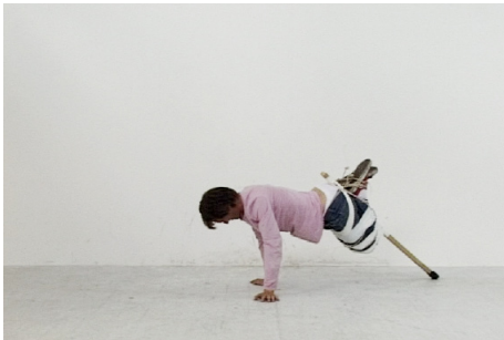
EXTENSIONS EX7 LOOP 2:38 MIN VARIOUS DIMENSIONS FOR PRESENTATION