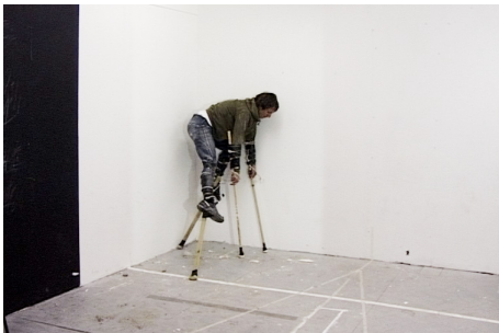
EXTENSIONS VINTAGE LOOP 1:08 MIN VARIOUS DIMENSIONS FOR PRESENTATION