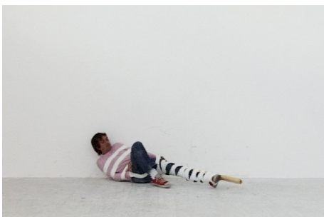
EXTENSIONS EX5 LOOP 5:04 MIN VARIOUS DIMENSIONS FOR PRESENTATION